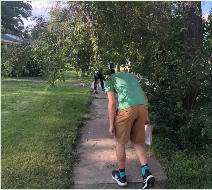
Figure 9 Overgrown Tree Branches on Harvey