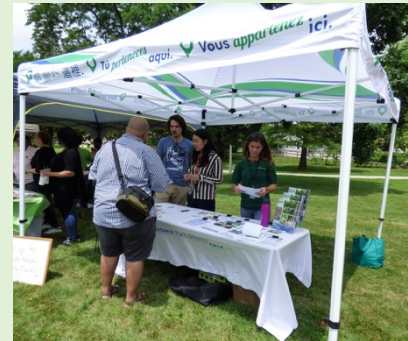
Figure 1 Community Engagement at Jetty Rhodes Day

A sign-up booth was set up at Jetty Rhodes day on June 22 th to introduce the program and gain interests for the walk audit. Six people signed up for the walk audit and about ten took audit materials. Some residents expressed dissatisfaction with night lighting in the park. We had 11 participants for Safe Routes to Victory Park Walking Audits conducted on July 10 from 5:30pm to 6:00pm.