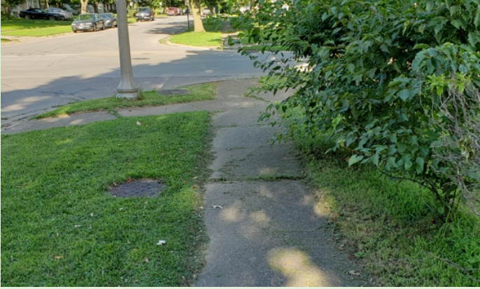
Figure 4 Overgrown Landscape