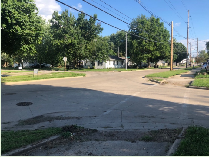
Figure 8 Looking south on Hill St. No Marked Crosswalk to Cross Goodwin