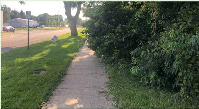
Figure 7 Overgrown Landscape on Hill St