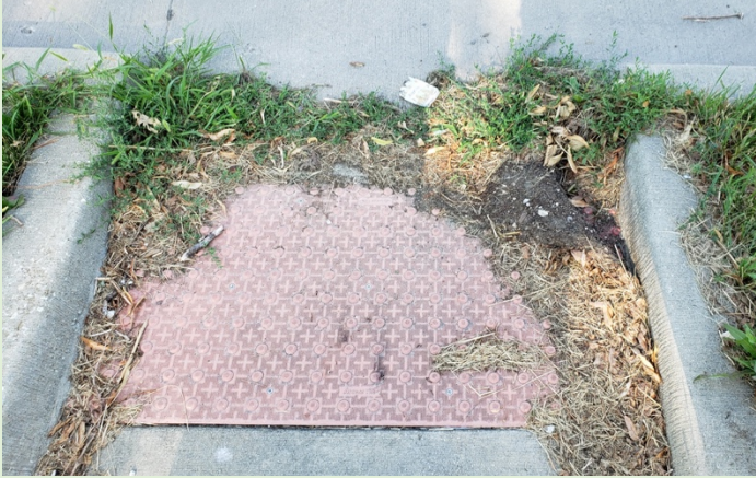
Figure 6 Dirt on a Ramp