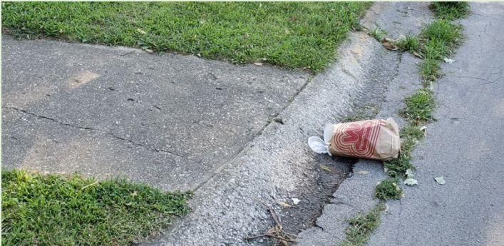
Figure 5 Trash on a Ramp